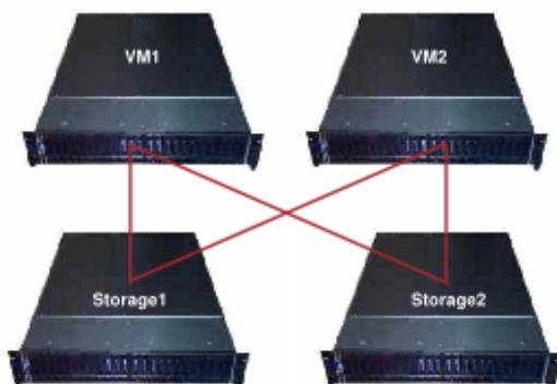
2 x VM Server, 2 x Storage: 1 x Redundancy

Because with virtualization, the machines in operation have to share the capacity of the hard disks, separate servers are usually configured for virtualization and data storage. Servers for virtualization contain as many CPU cores and as much RAM as possible, with the storage servers (storage, NAS, SAN etc.) providing fast hard disk links. However, what appears fully evident at first glance is not considered complete. Let us consider an implementation with 3 servers. Two servers work for virtualization, the third computer stores the data in two hard disk groupings with two separate controllers. We have a problem with this configuration, because there is again no redundancy. Should there be a problem with the data storage server for, the entire cluster fails.